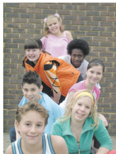
KERPOW! comes to the Abbey Theatre

Tickets for the first show, which starts at 2pm, are available at a special introductory rate of £2 each from the Abbey Theatre box office on 01727 857861.