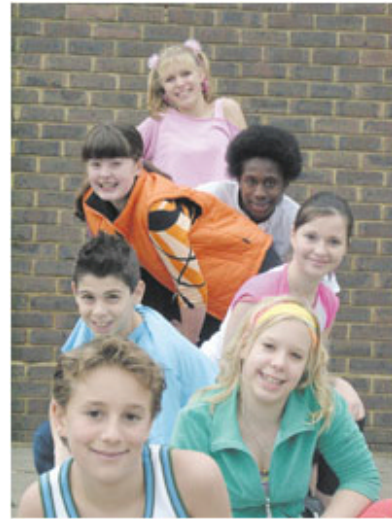
Kerpow! at the Abbey Theatre