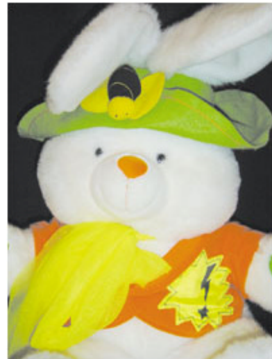
Pow the rabbit

Tickets are £4 each from the box office on 01727 857861. Further information is available on www.kerpow.org.uk