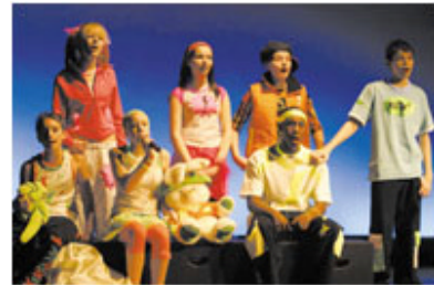
Kerpow! in action at the Abbey Theatre

Tickets are £4, available from the Abbey Theatre box office on 01727 857861. More information is available by visiting www.kerpow.org.uk