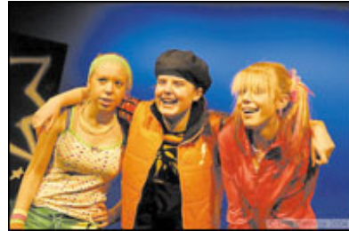
The girls from Kerpow! at the Abbey theatre

The next chance to catch them - and Pow's solo - is at 2pm on Sunday, May 15. Tickets cost £4 each and can be booked through the box office on 01727 857861. Further details are available at www.kerpow.org.uk